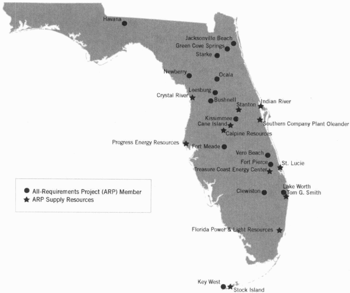
Figure ES-1 ARP Participants and FMPA Power Supply Resource Locations

A location map of the ARP Participants and FMPA's power resources as of January 1, 2010 is shown in Figure ES-1.