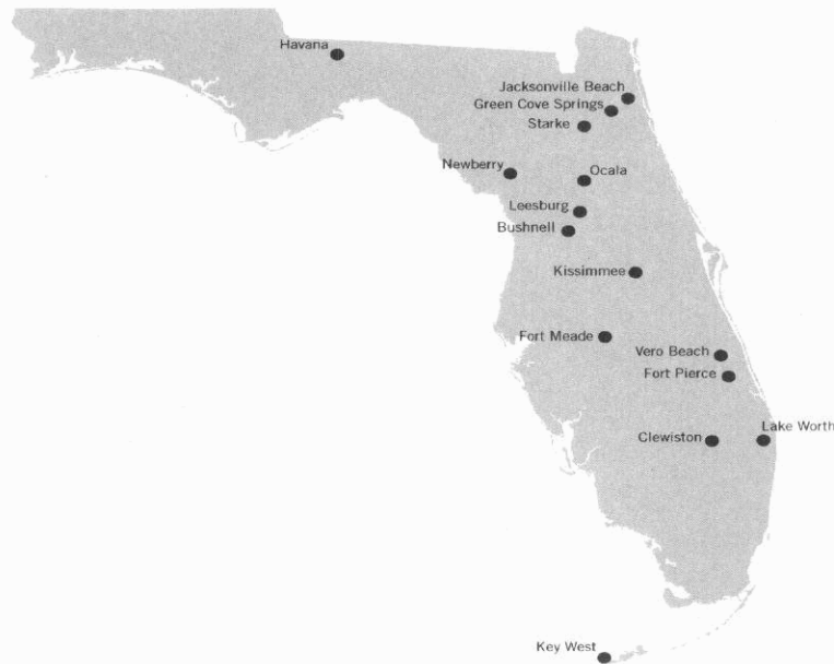
Figure 1-1 ARP Participant Cities

On December 9, 2004, the City of Vero Beach provided notice to FMPA, pursuant to the All-Requirements Power Supply Project Contract, that it will exercise the right to modify its ARP full requirements membership beginning January 1, 2010. In addition, on December 17, 2008, the City of Lake Worth provided notice to FMPA that it will exercise the right to modify its ARP full requirements membership beginning January 1, 2014. The effect of these notices is that the ARP will no longer utilize the cities' generating resources, and the ARP will commence serving the cities' load on a partial requirements basis. The amount of the partial requirements for Vero Beach served by the ARP has been established as zero MW, and the amount of the partial requirements for Lake Worth served by the ARP will be established in 2013.