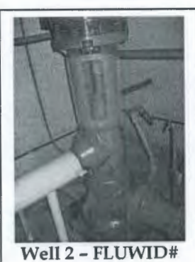
Well 2 - FLUWID# AAB4621