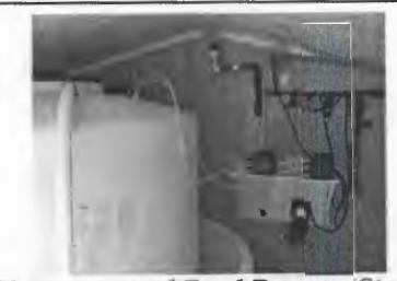
NaOCl Storage and Feed Pumps (Stenner 40