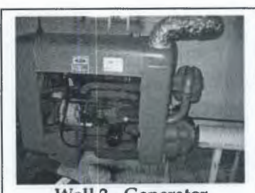
Well 2 - Generator