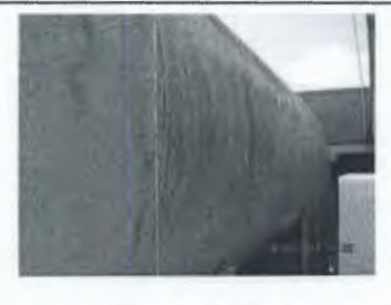
Well 1 - 5000 gal Hydropneumatic Storage Tank