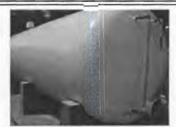
Wells 13/17 - 10,000 gal Hydropneumatic Storage Tank Pressure Gauge