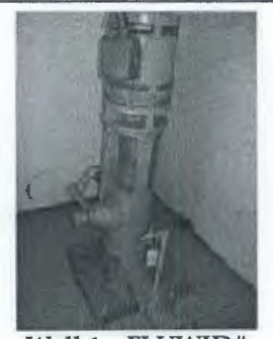
Well 1 - FLUWID# AAB4622