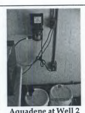
Aquadene at Well 2