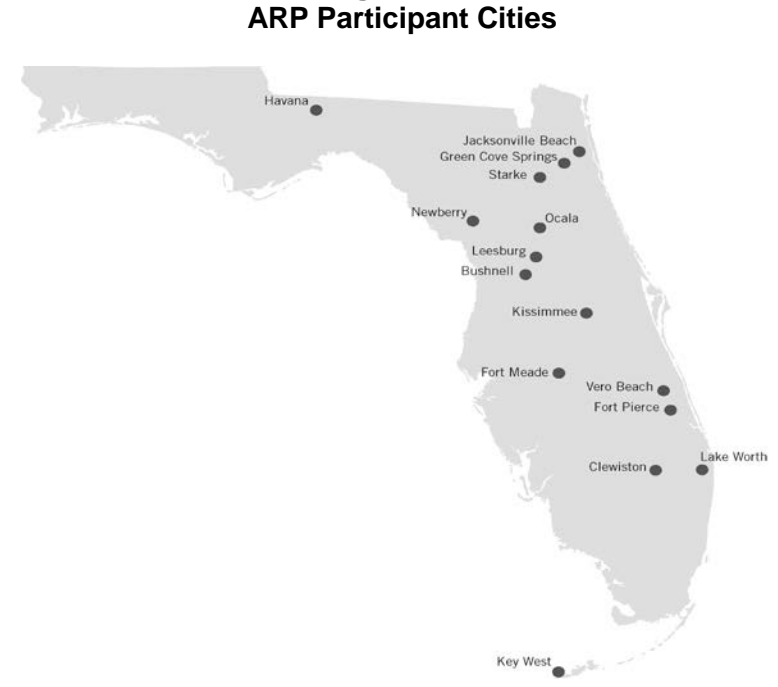
Figure 1-1 ARP Participant Cities

On December 9, 2004, the City of Vero Beach provided notice to FMPA, pursuant to the All-Requirements Power Supply Project Contract, that it was going to exercise the right to modify its ARP full requirements membership and request and establish a Contract Rate of Delivery (CROD) which began January 1, 2010. On December 17, 2008, the City of Lake Worth provided notice to FMPA that it was going to exercise the right to modify its ARP full requirements membership and establish a CROD beginning January 1, 2014. In addition, on July 14, 2009, the City of Fort Meade provided notice to FMPA that it will also exercise its right to modify its full requirements membership and establish a CROD beginning January 1, 2015. The effect of these notices is that the ARP will no longer utilize these ARP Participants' generating resources (if any), and the ARP will commence serving up to a calculated maximum amount of capacity and energy for these ARP Participants (with these ARP participants being responsible for meeting all of their electric demand in excess of FMPA's obligation). The amount of the CROD for Vero Beach and Lake Worth served by the ARP has been established as zero (0) MW, and the amount of the CROD for Fort Meade will be established in December of 2014.