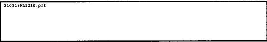
Name of Attached Document

<1210> Terms & Conditions of Voice Telephony Lifeline Plans