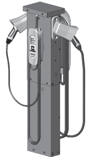
Combo ClipperCreek HCS and LCS/ACS EVSE