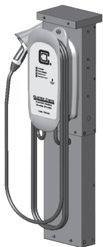
Single ClipperCreek HCS EVSE