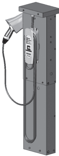
Single ClipperCreek LCS/ACS EVSE