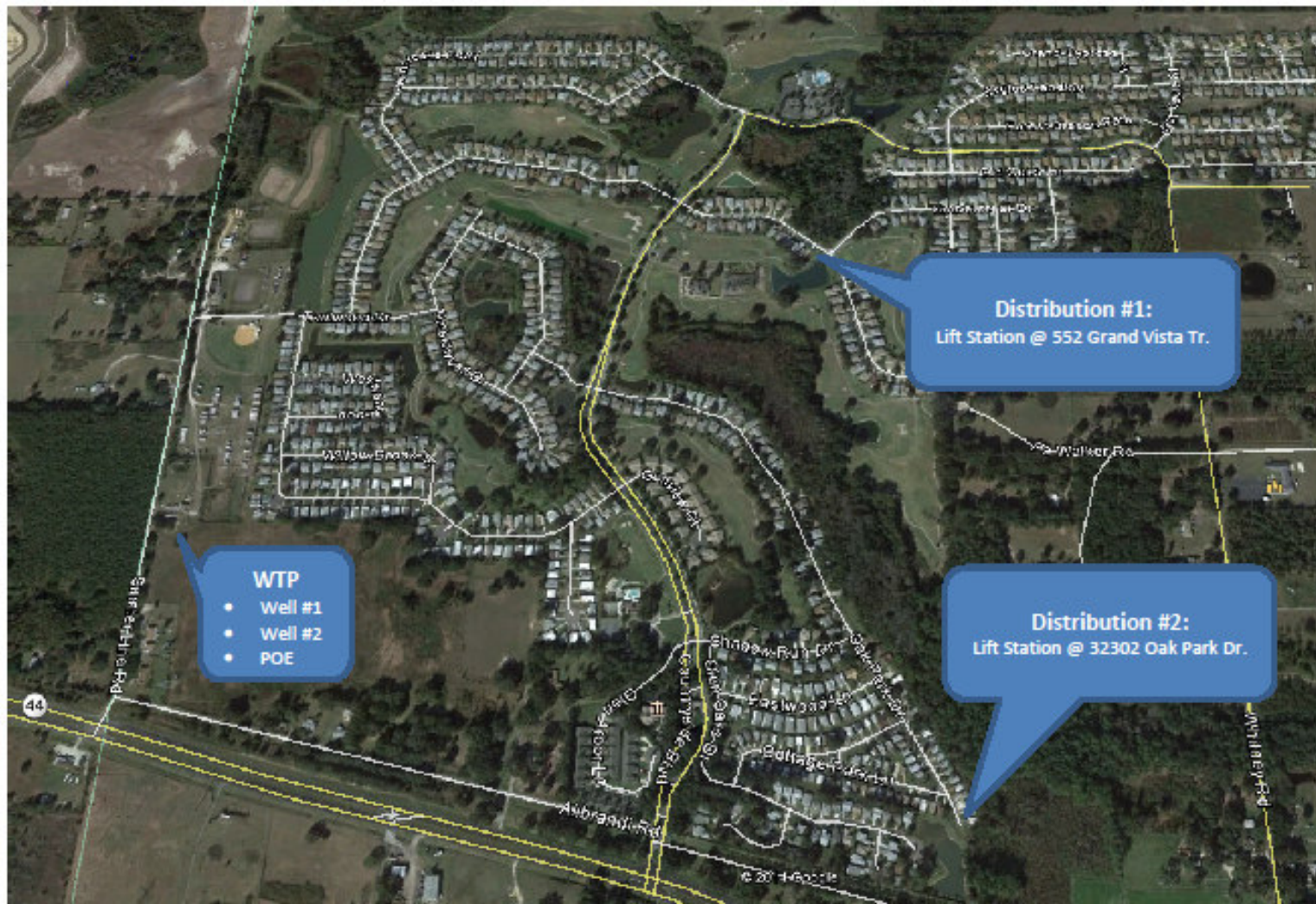
FIGURE 2: Pennbrooke Water System Sample Locations (June 4, 2014)