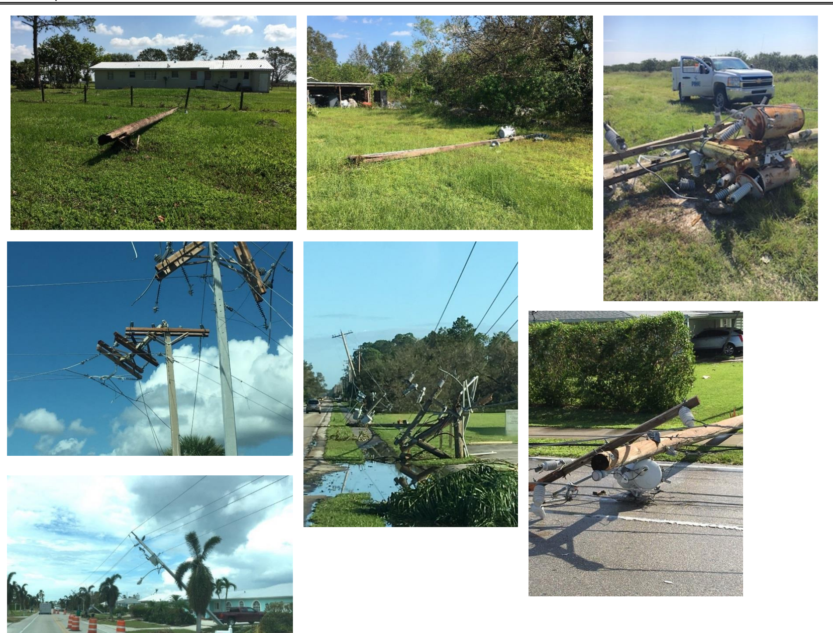
Responses for Hurricane Irma only.