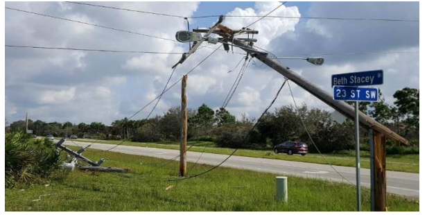
Responses for Hurricane Irma only.