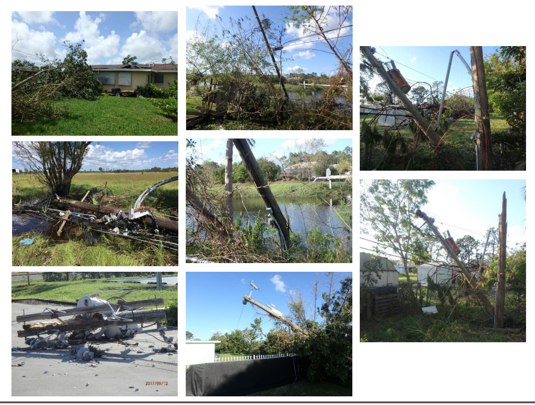
Responses for Hurricane Irma only.