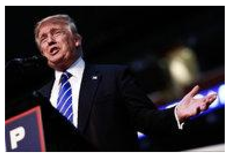
Donald Trump says he wants to cut taxes for middle-class and wealthy Americans as well as for businesses.

Mr. Trump also wants to make child care tax-deductible. If the policy were implemented as a typical deduction, it would provide no advantage for the 45 percent of people paying no tax and provide the biggest advantages to people in high-income tax brackets. His campaign has indicated that the Trump administration would find ways to make its advantages shared more broadly, though staffers had no details.