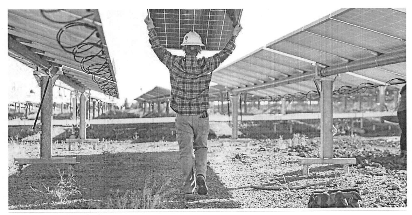
Cypress Creek - Danner Boots advertisement