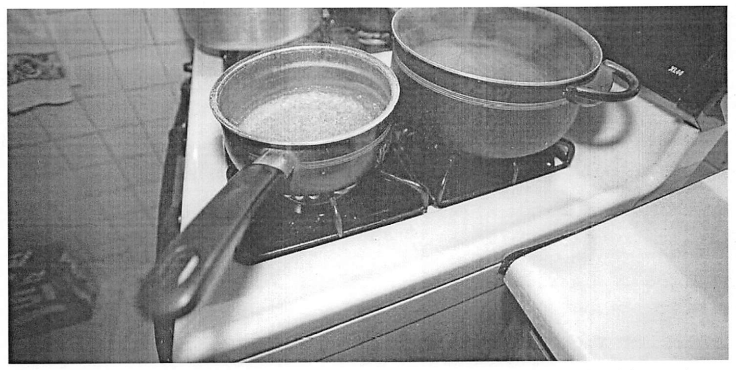
Water should be boiled for one minute before use for drinking, cooking, making ice, brushing teeth or washing dishes, stated a notice from Lauderhill.

A boil-water notice was issued Sunday evening for parts of Lauderhill after a water main was broken by a contractor for Florida Power & Light Co.