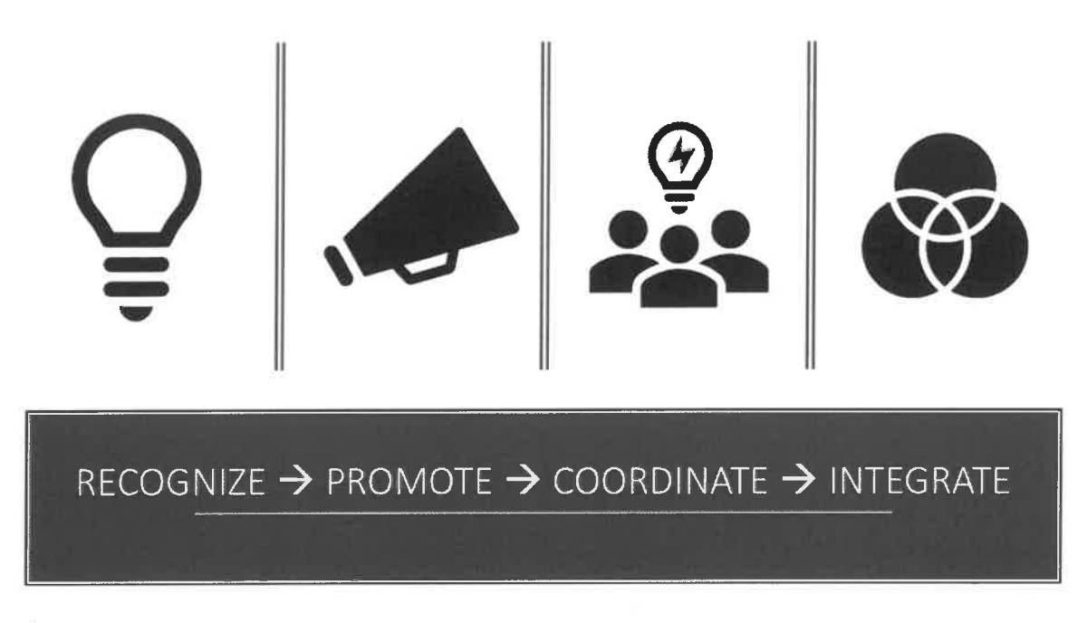
Figure 2. Levels of program integration

Additionally, while they have not established specific programs, the California utilities and Oklahoma Gas & Electric (OG&E) have all conducted research on the benefits of and new approaches to integration. OG&E, for example, studied the cost efficiencies involved in low-income and multifamily energy storage systems acting as an energy efficiency measure and participating in DR programs.