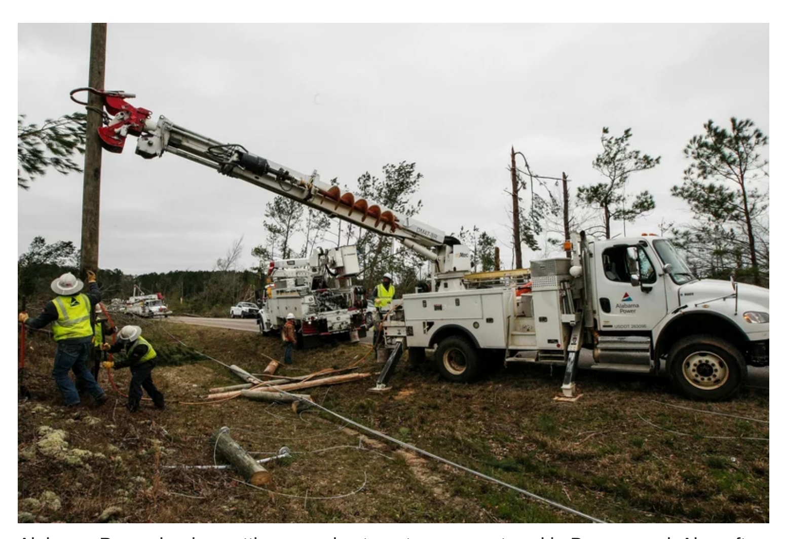
Alabama Power begins putting up poles to get power restored in Beauregard, Ala., after a tornado in 2019. The power company was a client of Matrix.

They also cast blame on one another over a series of recent scandals. Matrix recently made headlines for surveillance of a power company CEO and a journalist who wrote critically about Florida Power & Light's business plans. Matrix has also been accused of seeking to influence ballot initiatives on clean energy and offering a lucrative job to a public official in Jacksonville to induce him to resign. Florida Power & Light did not respond to a detailed list of questions, and an executive for the company declined to address them in a phone call.