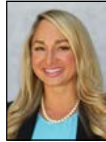
COMMISSIONER Gabriella Passidomo