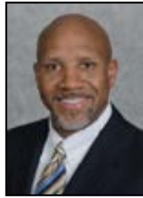
COMMISSIONER Art Graham