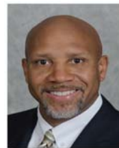
COMMISSIONER Art Graham