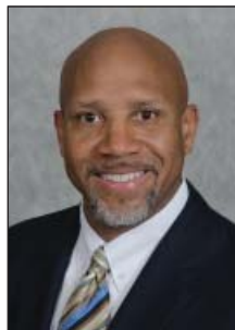
COMMISSIONER Art Graham