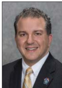
COMMISSIONER Jimmy Patronis