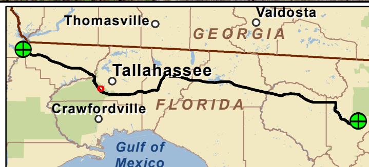
FIGURE 4 TALLAHASSEE AIRPORT STAGING AREA GOPHER TORTOISE SURVEY MAP

COUNTY: LEON SCALE: 1 in = 200 feet FILE NAME: NFRC_StagingAirportGT DRAWN BY: unash DATE: 6/17/2020 8:07:03 AM