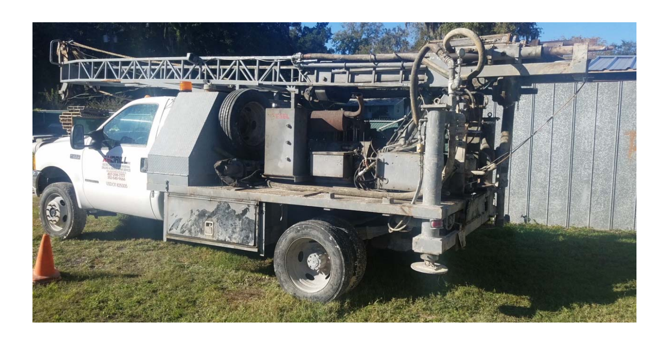
Page 4 of 4 AID 41487 LOA 100018-LA-Boring Access-UF/IFAS NW Research Center

Drill Rig: Standard Truck Rig (see photo below)