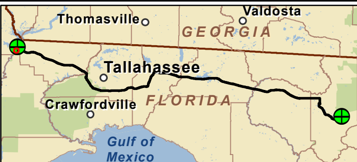
FIGURE 5 GEOTECH SOILS MAP